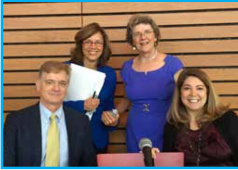
Panelists gather for their session "Always at the Center, but Never at the Front? The role of women in the Church."

A one-day forum on July 25 at Chicago Theological Seminary examined and discussed Pope Francis' reforms in the Catholic church with a focus on the largely ignored concern of the role of women in the church. Speakers included experts in church history, Catholic theology, and the lived experience of Catholic women.