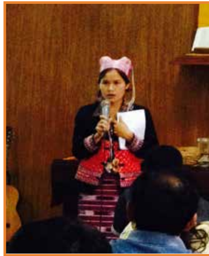
Filipino Woman Addresses Participants

who explained the historical roots of the Islamic fundamentalism we see today and who vigorously denied that such groups as ISIS have any legitimate claim to Islam.